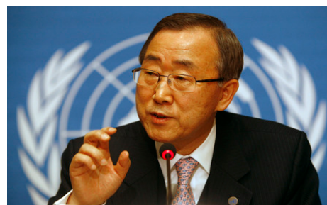
UN Secretary General Ban Ki-moon

Ban Ki-moon's message also relayed his appreciation of CARICOM's contributions to numerous global issues including the millennium development goals, climate change and addressing non-communicable diseases inter alia. He urged that there be 'global partnership for the prosperity of all states especially small vulnerable Small Island Developing States (SIDS).